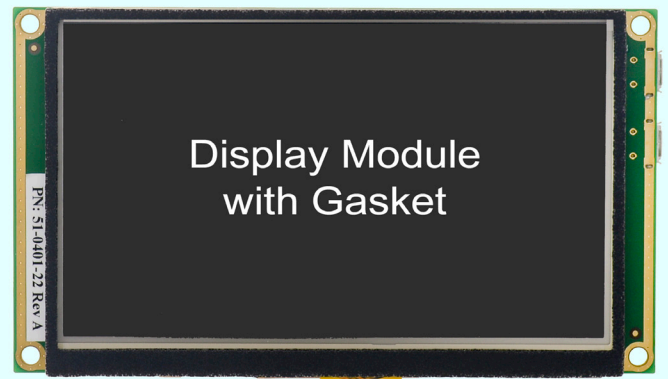
Shown Above: 4.3" Display Module with Black Silicone Foam HT-800 Gasket.