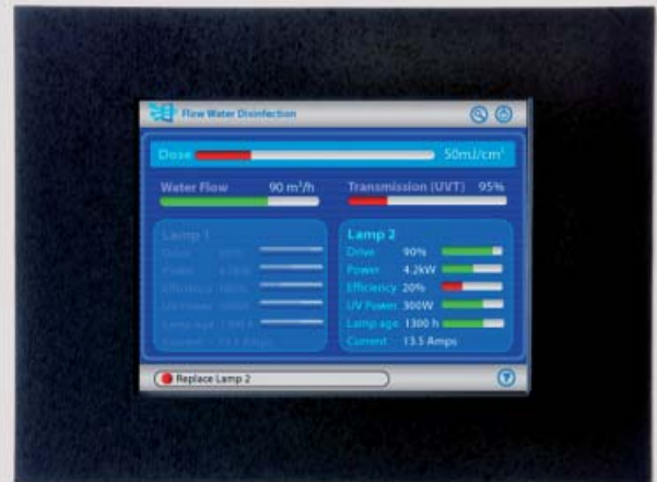
5.7-inch Prime View Enclosed Unit front view

Visit our, "How can I get stated?" webpage, call 510-770-1417, or email sales@reachtech.com for more information or to order.