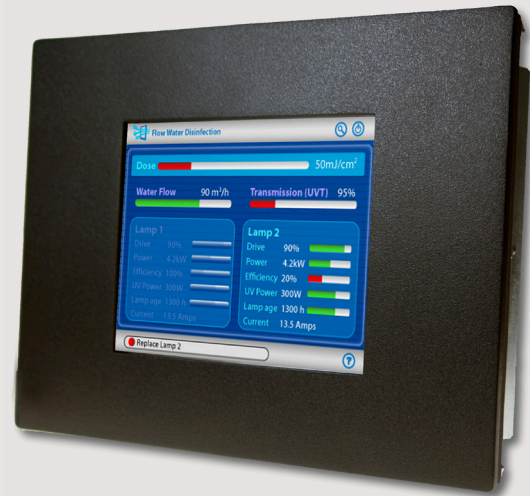
5.7-inch Hitachi Enclosed Unit front view

Visit our, "How can I get stated?" webpage, call 510-770-1417, or email sales@reachtech.com for more information or to order.