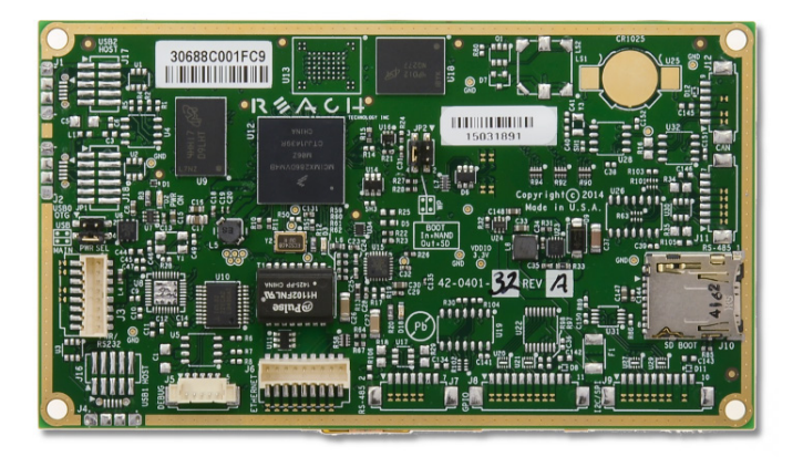
4.3" G2C1L-R Display Module, back view