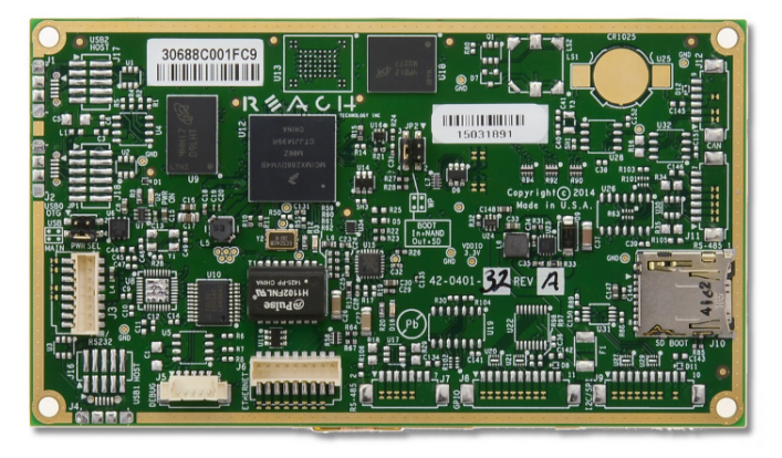
4.3" G2C1L-P Display Module, back view